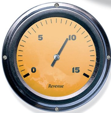
Median revenue ($9.9 million)