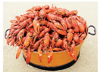
3 Baton Rouge, La. (14) $18.8 million