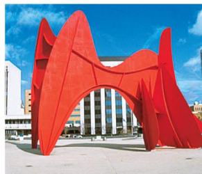
1 Grand Rapids, Mich. (16 companies) $26.2 million