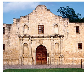
2 San Antonio (25) $21.3 million